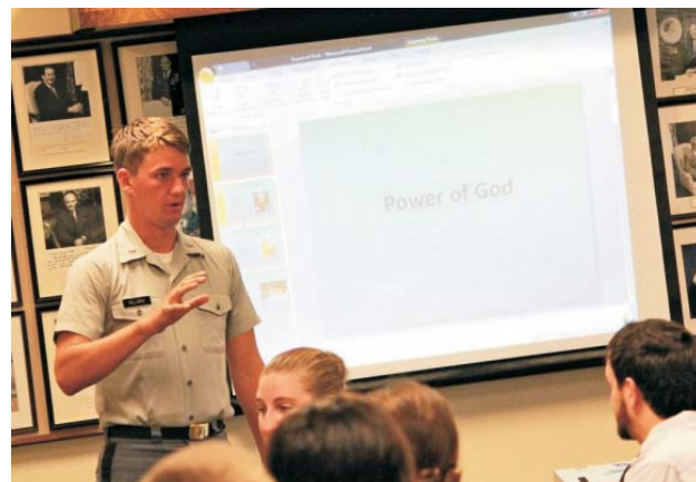
An evening at the Citadel Monday large group.