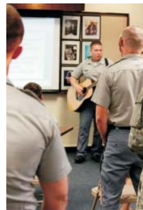
We go acoustic!