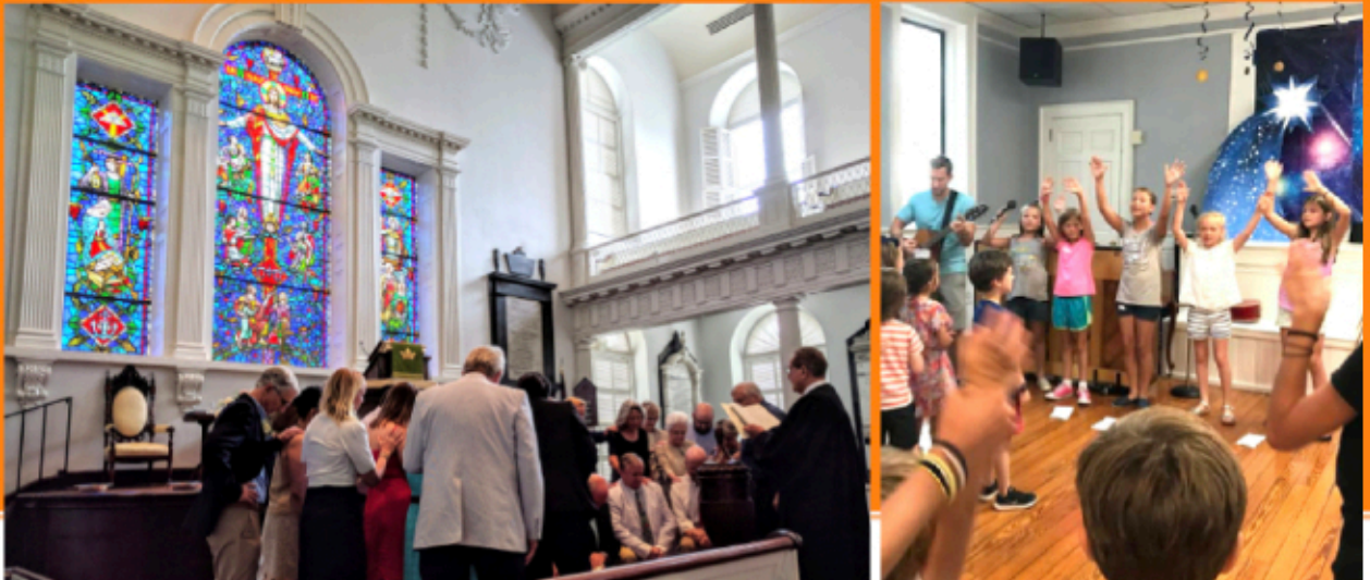
LEFT: ORDINATION AND INSTALLATION OF ELDERS AND DEACONS RIGHT: VACATION BIBLE SCHOOL

SECOND PRESBYTERIAN CHURCH OF CHARLESTON