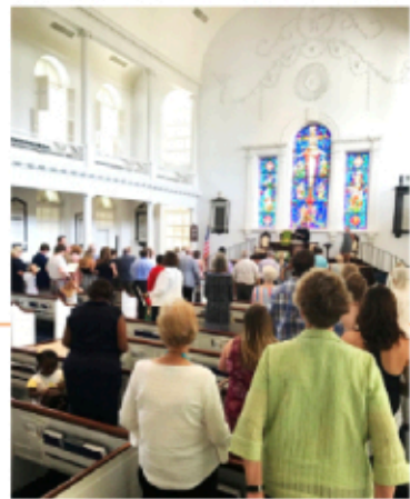
1: VBS GRAFFITI WALL 2: FELLOWSHIP & REFRESHMENTS ON THE PORTICO AFTER WORSHIP IN JULY 3: JOINT SUMMER WORSHIP SERVICE QUOTE: FROM THE HYMN WRITTEN AT THE TOP OF OUR VBS GRAFFITI WALL