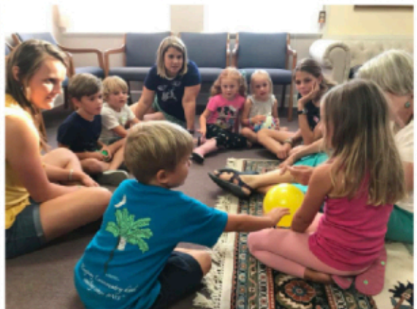
LEFT: MONTREAT SUMMER YOUTH CONFERENCES RIGHT & ACROSS: VACATION BIBLE SCHOOL