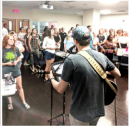
TOP ROW: OPENING NIGHT OF WORSHIP AT THE CITADEL BOTTOM ROW: COLLEGE OF CHARLESTON BACK-TO-SCHOOL BBQ & OPENING NIGHT OF WORSHIP