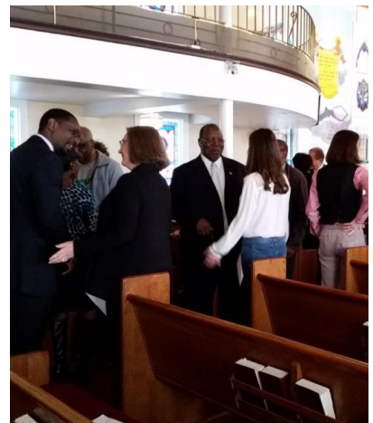
Prayer Gathering at Ebenezer A.M.E. Church on Nassau Street

An ongoing community-wide effort wherein people of various races, cultures and faith traditions regularly pray together for the success of the Illumination Project